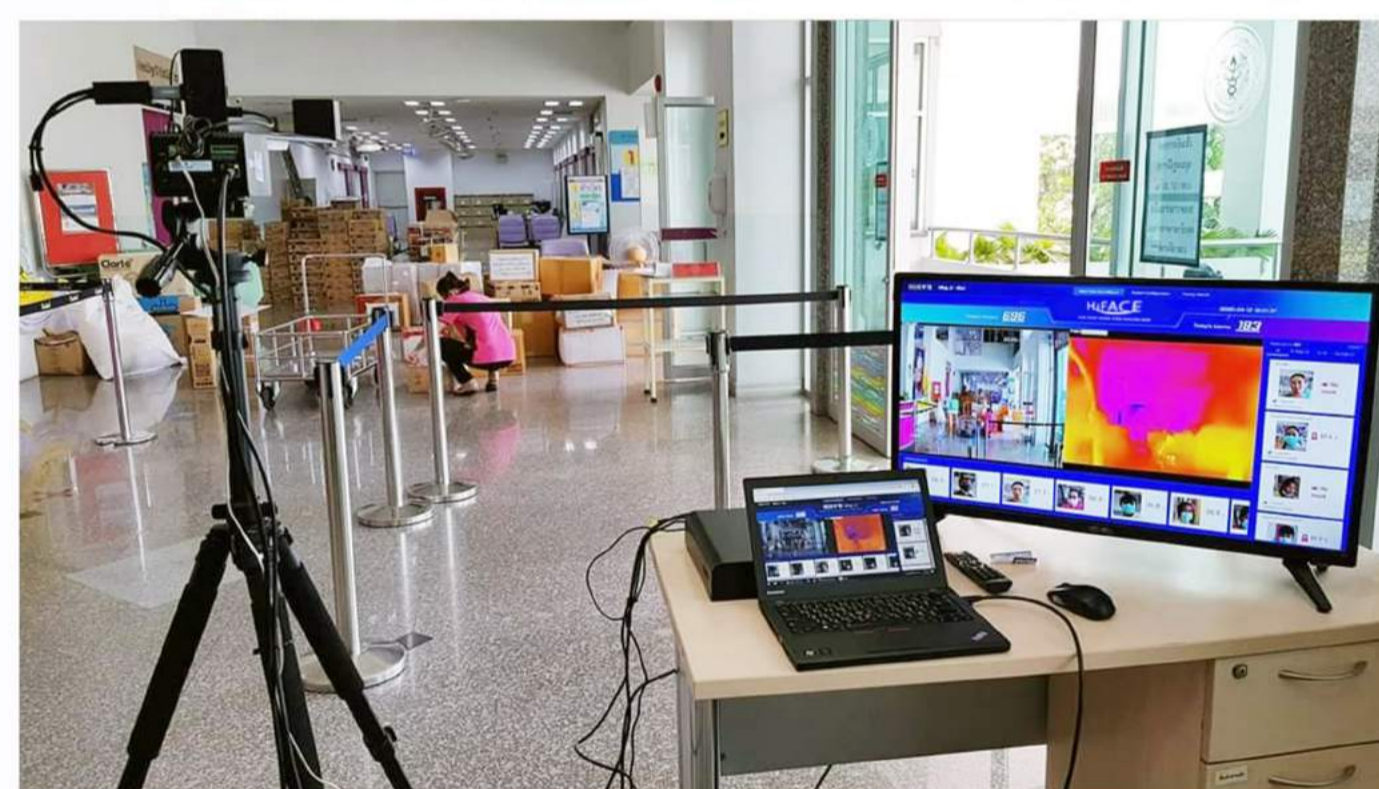
Khu Vực Bệnh Viện/ Cơ Quan Nhà Nước Entrances to Residential Buildings