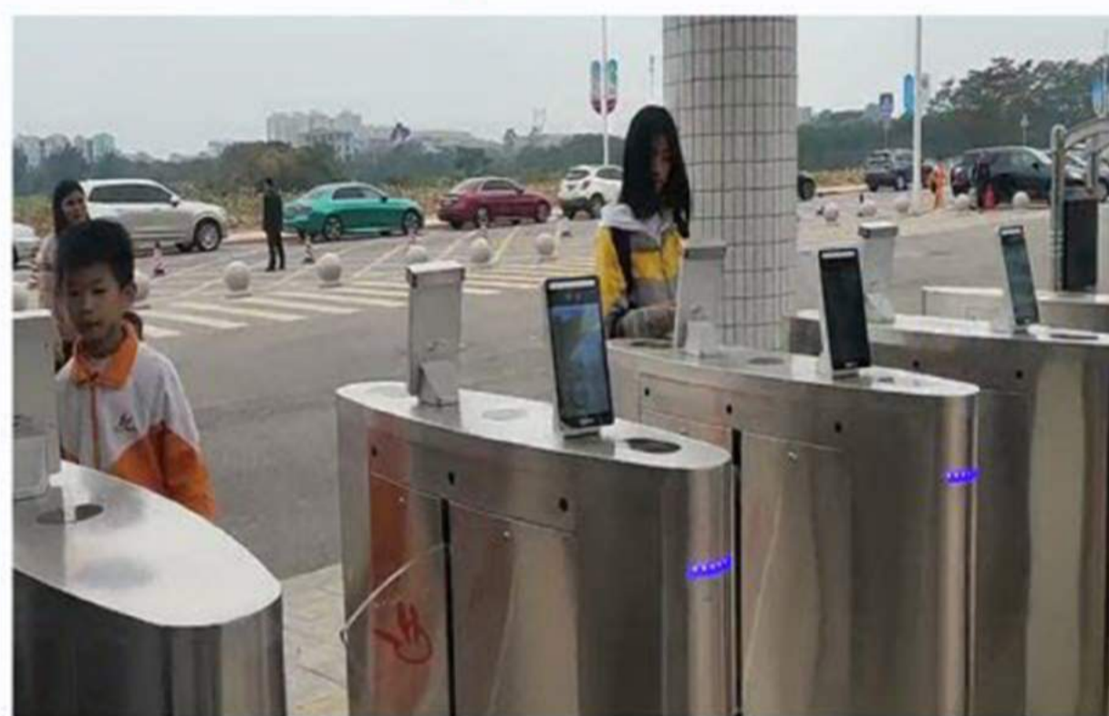
Cổng Ra Vào Khu Đông Người Campus Entrances