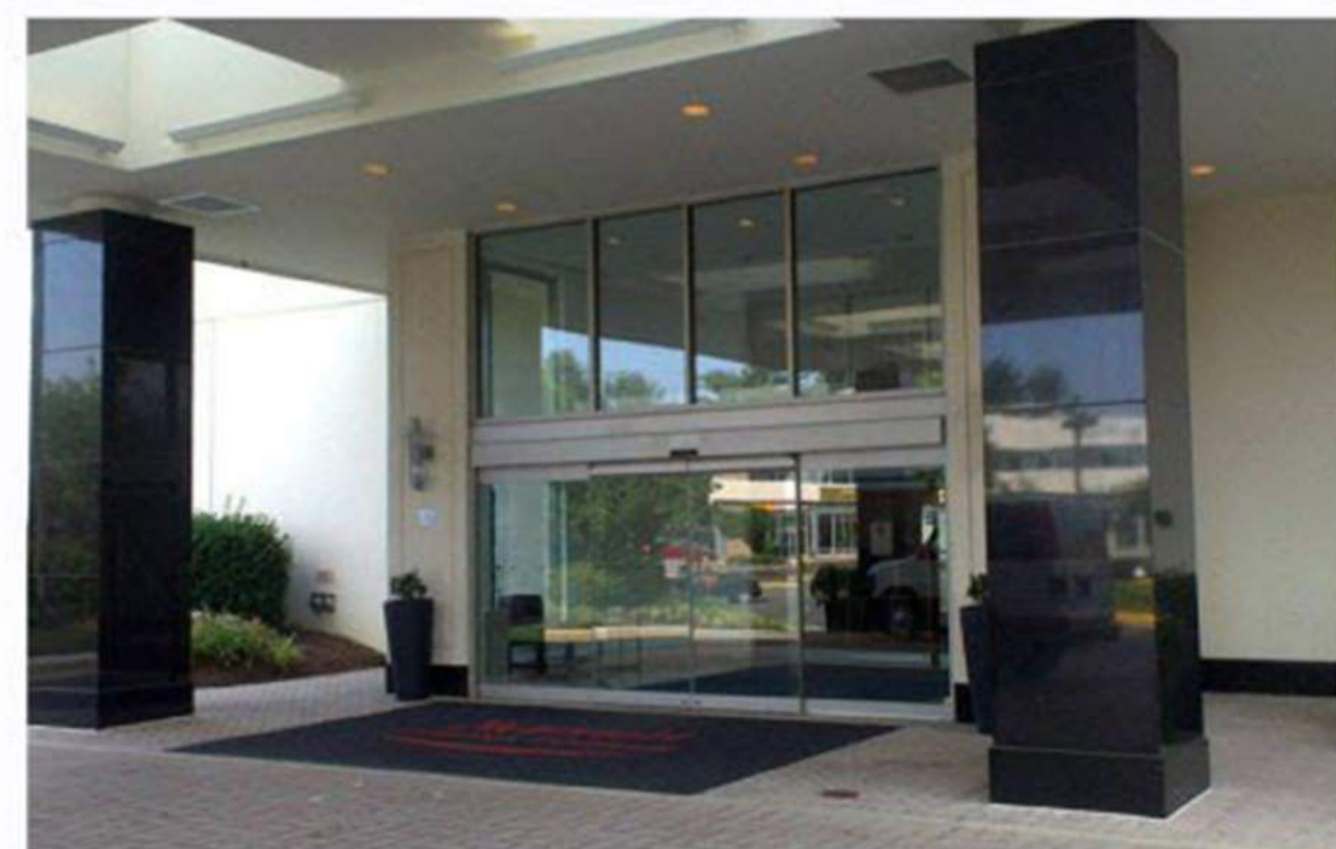
Văn phòng, TT Thương Mại, Bán Lê Offices